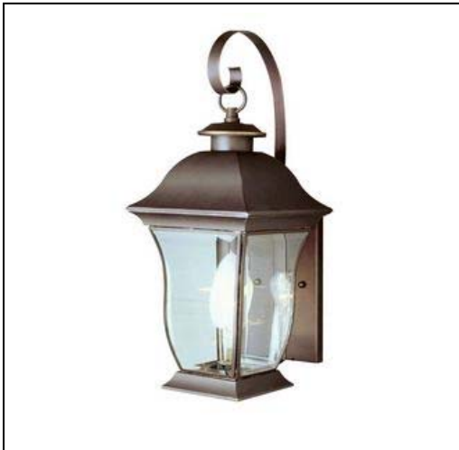
4970 WB: 1 Light Coach Lantern