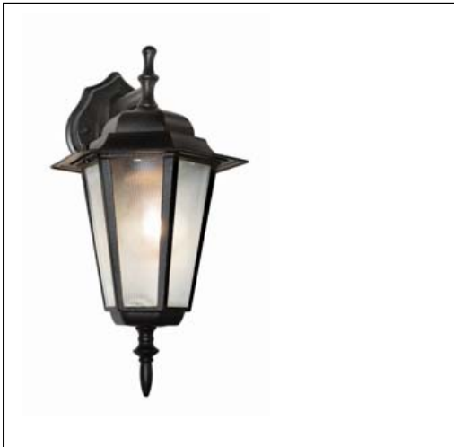
4056 BK: 1 Light Coach Lantern