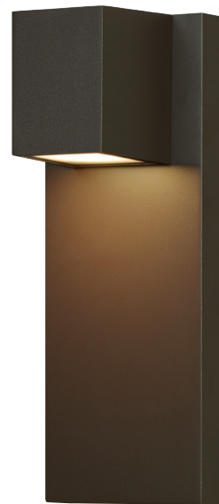
QUADRATE shown in bronze

* Visit techlighting.com for specific warranty limitations and details.