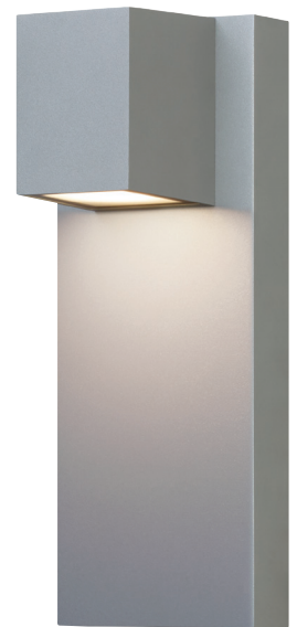
QUADRATE shown in silver