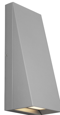
PITCH 12 shown in silver