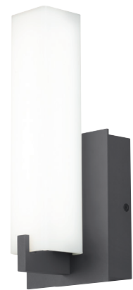
COSMO 12 shown in charcoal