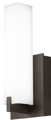
COSMO 12 shown in bronze

* Visit techlighting.com for specific warranty limitations and details.