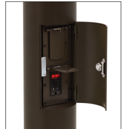
Shown with optional GFCI outlets