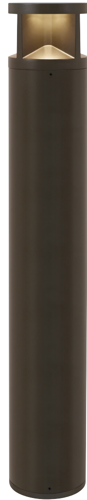
ARKAY 2 BOLLARD shown in bronze