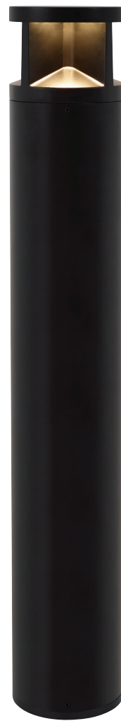
ARKAY 2 BOLLARD shown in black