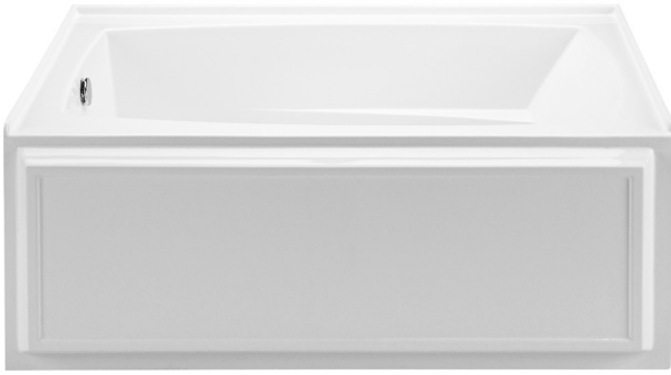
Wyndham 5 features integral skirting, tile flange and armrests.