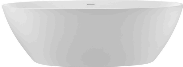
Shown above as soaking bath without pedestal