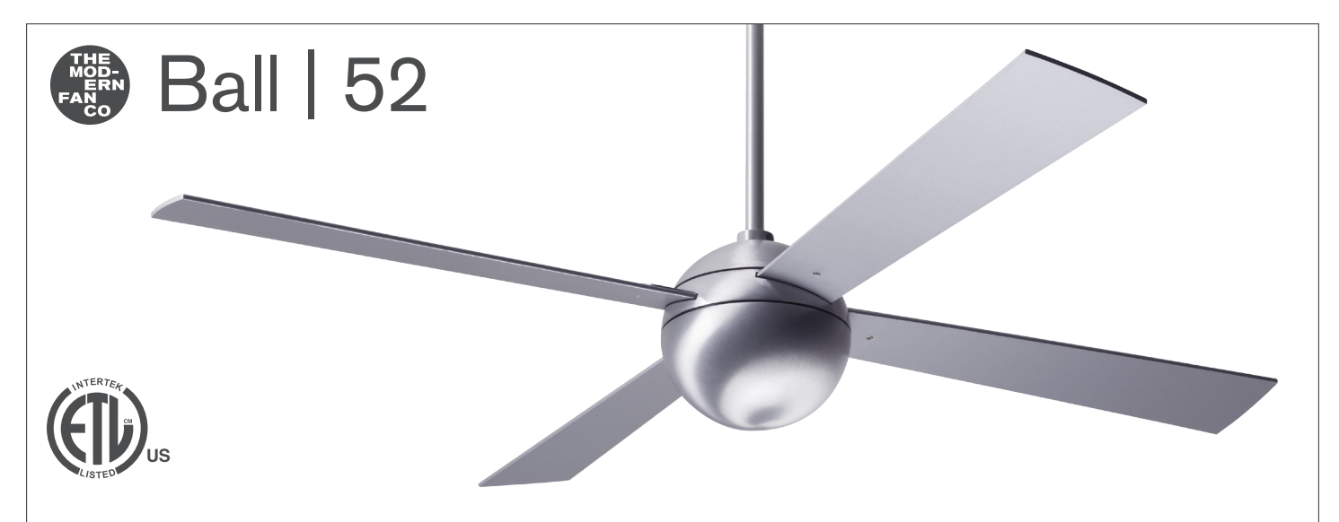
Ball | 52 > Configure item number from attributes below.