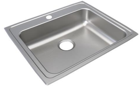
Shown with one-hole configuration. Other configurations available.

Cutout Dimensions for Drop-in Installation: 24-3/8" x 20-5/8" (619mm x 524mm) with 1-1/2" (38mm) corner radius