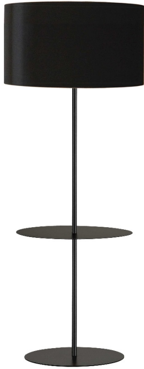
1 Light Incan Rnd. Base with Rnd. Shelf, Matte Black with Black Shade