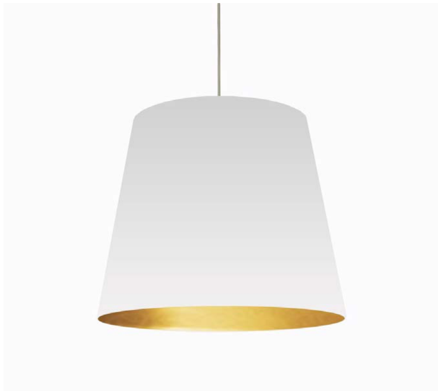
1 Light Tapered Drum Pendant with White on Gold Shade

Height 26 Width/Length 26 Depth 21 Weight 11